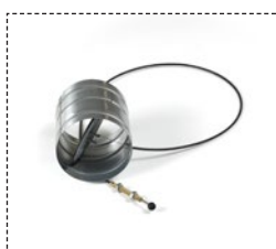
Outside air valve