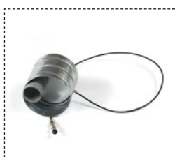
Open fire valve